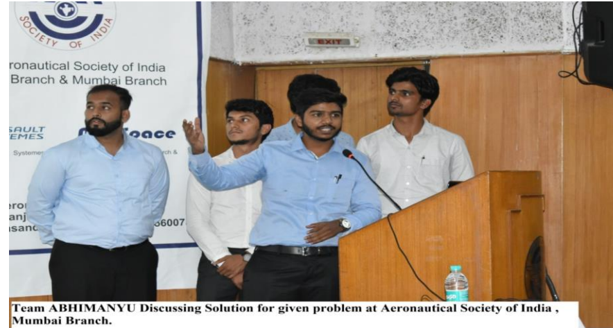
Team ABHIMANYU Discussing Solution for given problem at Aeronautical Society of India , Mumbai Branch.

The third round includes the submission of the final report, wherein the team did stability, analysis, and the finalists were asked to prepare a Power Point presentation.